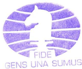
Arkady Dvorkovich FIDE President