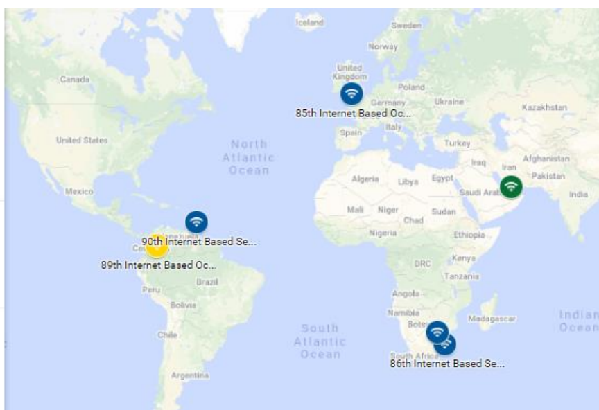
Map 2 – Seminars announced by September 16th 2020