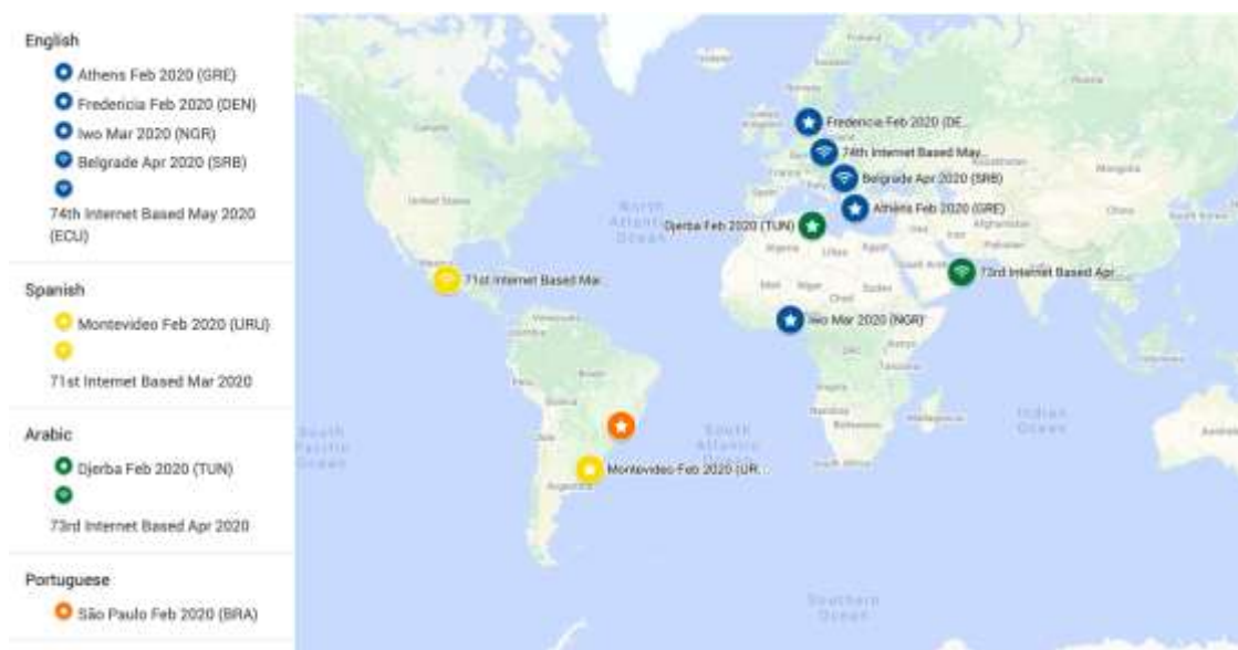
Map 1 – Seminars reported for 2nd FIDE Council 2020