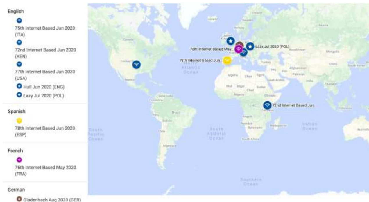
Map 2 – Seminars announced by May 26th 2020

One seminar planned in Ostfildern, Germany, 11-14 June 2020 was canceled.