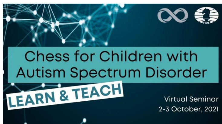
2 The Chess for Children with Autism Spectrum Disorder project has applied for Erasmus funding for a major research project starting later in 2022

Since the survey was launched, many federations and others have approached SC with information about local chess projects with social content, focusing on many different aspects of life, including asylum seekers in western countries, people with systems abuse issues, mental health, elderly care, children in slums, and other.