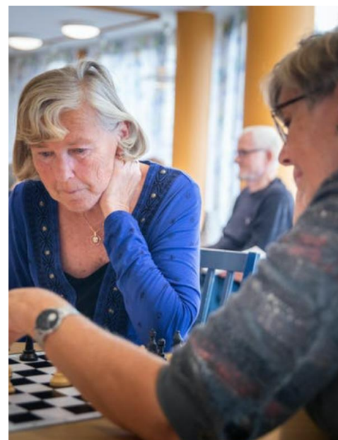
4 Next major initiative from SC: Chess and Brain Aging