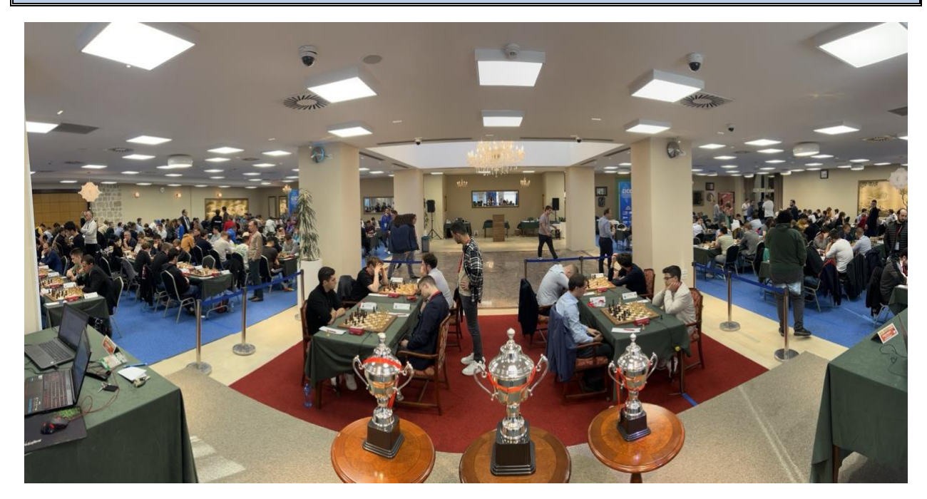
The championship will be held from 23<sup>rd</sup> February to 8<sup>th</sup> March 2025 in Petrovac. Playing hall will be situated at the Hotel "Palas" in Petrovac.