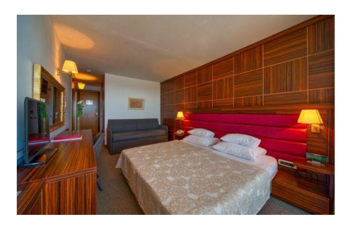
Hotel "Palas Lux" 5