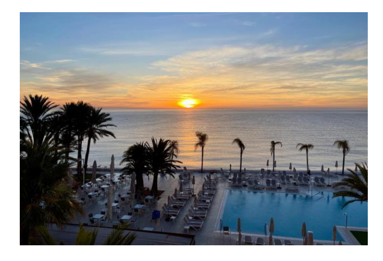
Hotel Cap Negret Altea

The winner in each category will receive the free participation and free hotel in the open tournament 3th Cap Negret Senior Open 50+ 65+ from 08 till 16 November 2025 in Altea – Alicante Spain.