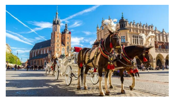
Main Market Square in Krakow

FIDE, the Polish Chess Federation and Malopolska Chess Assosiation invite all FIDE member federations and eligible teams to participate in the FIDE World Senior Team Chess Championship (50+ 65+), which is to be held in Krakow- Poland, from 01.07.2024 arrival day till 12.07.2024 departure day.